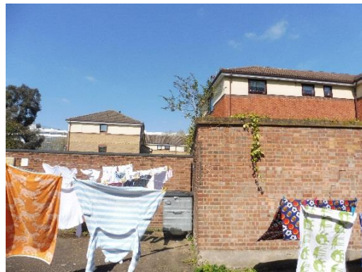
Structure of Reubens Court.