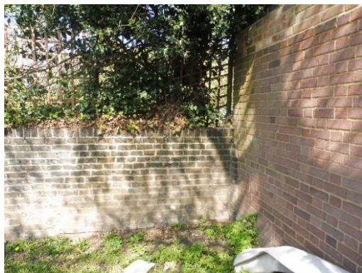
Structure of 5 Oxford Road North.